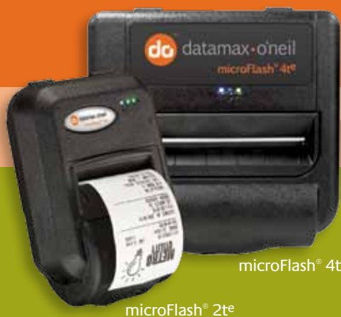
microFlash® 4t e