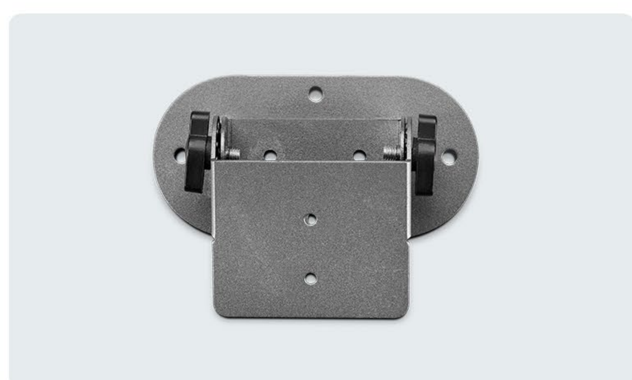
MOT-V600 Holder, 110*50*40*1.5