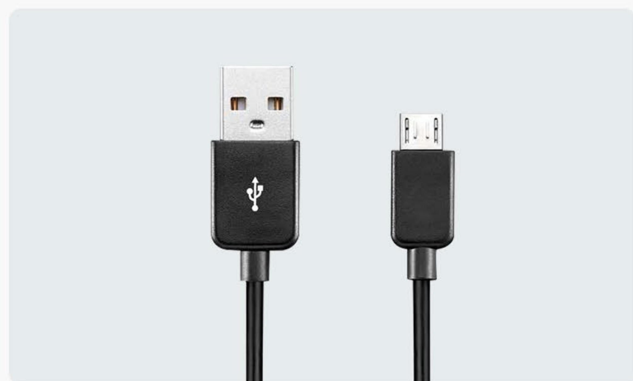
DC-V600-USB USB cable