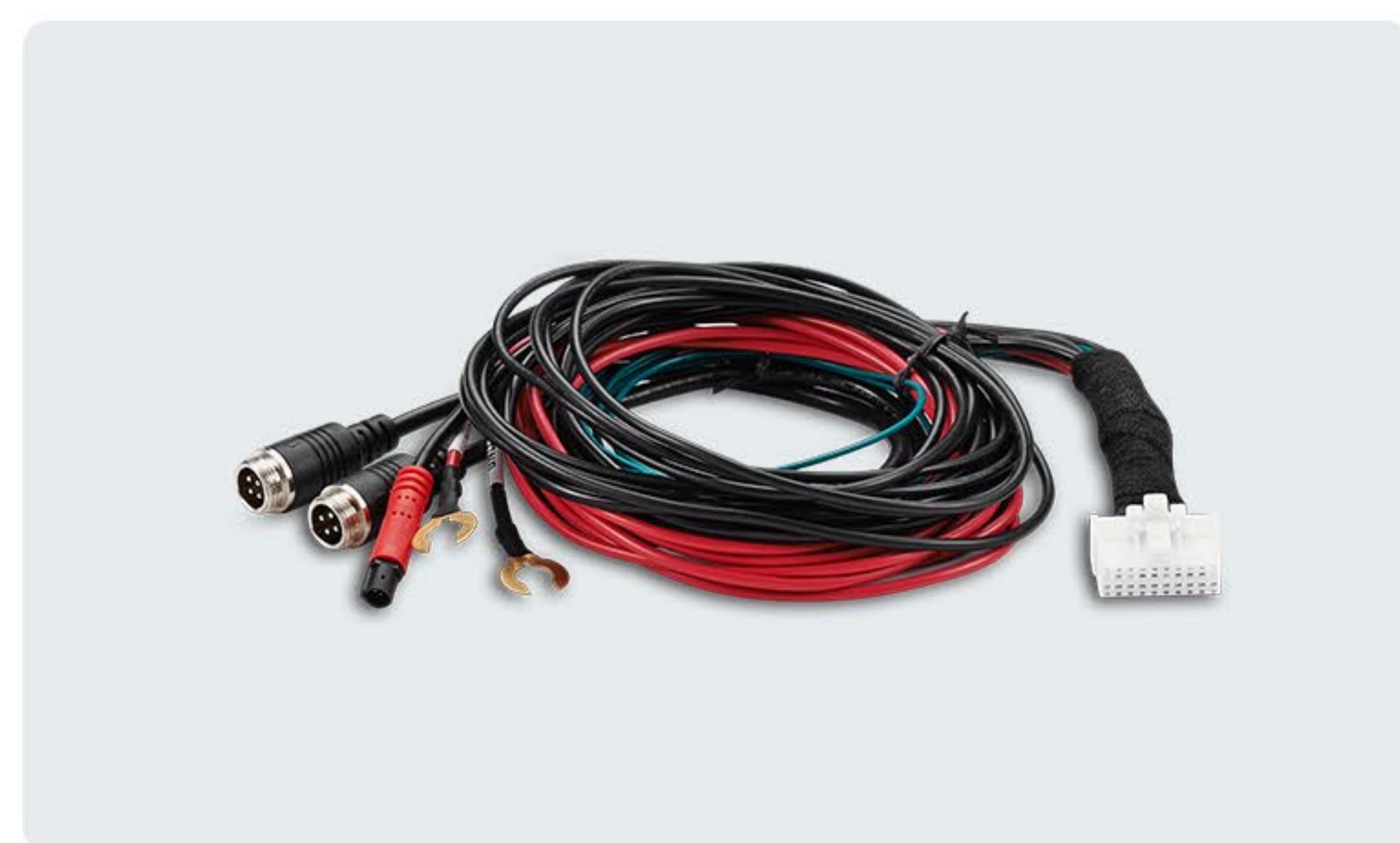
CAB-V600 V600 bus, including dual-camera port and OBD port