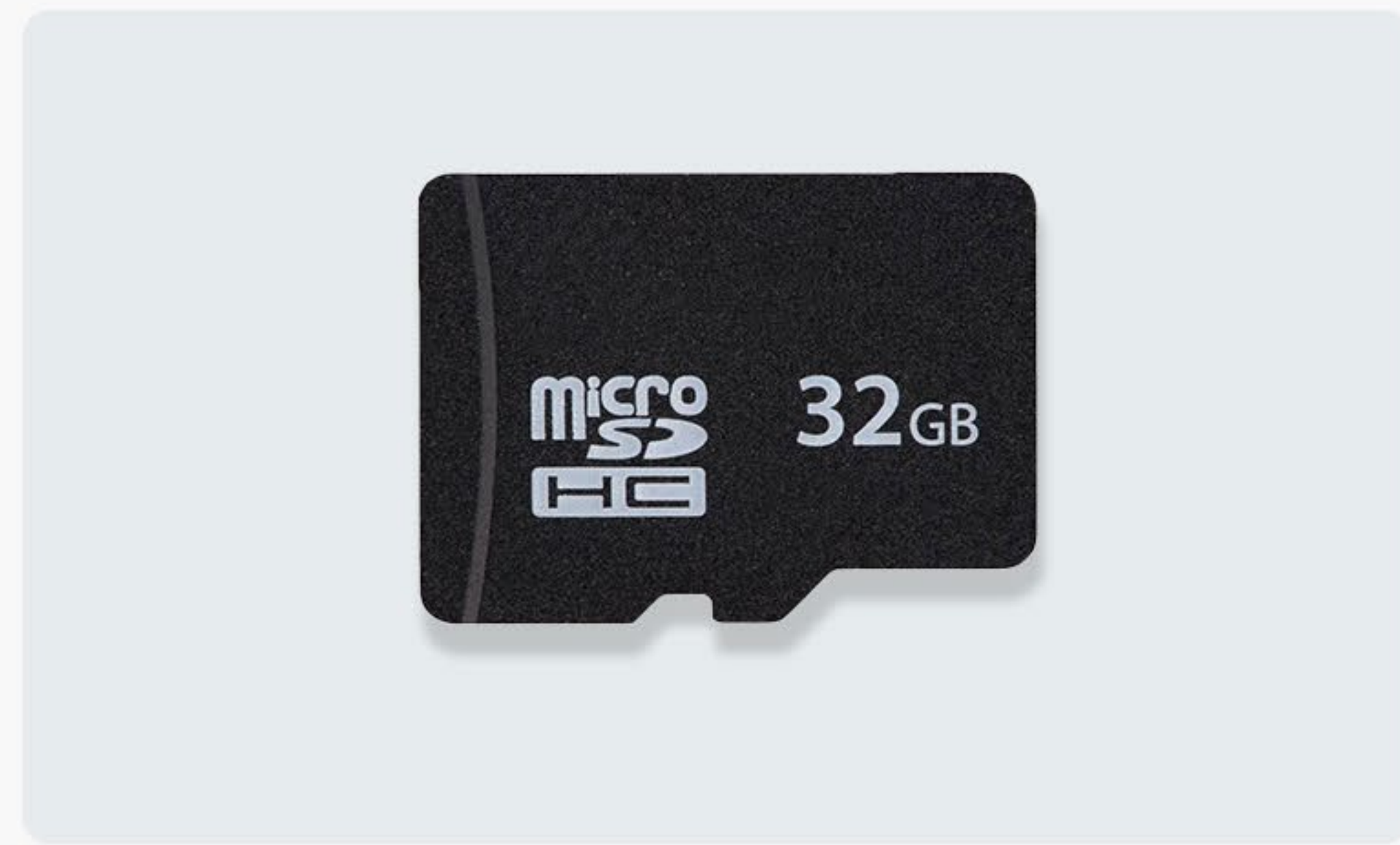
TF-CARD-32 32G TF card