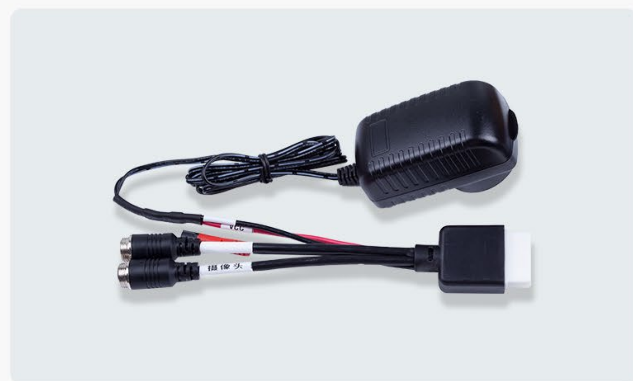
PWR-V600-12V2A-US Adapter that used for developer, I/P: 100-240V, O/P: 12V2A