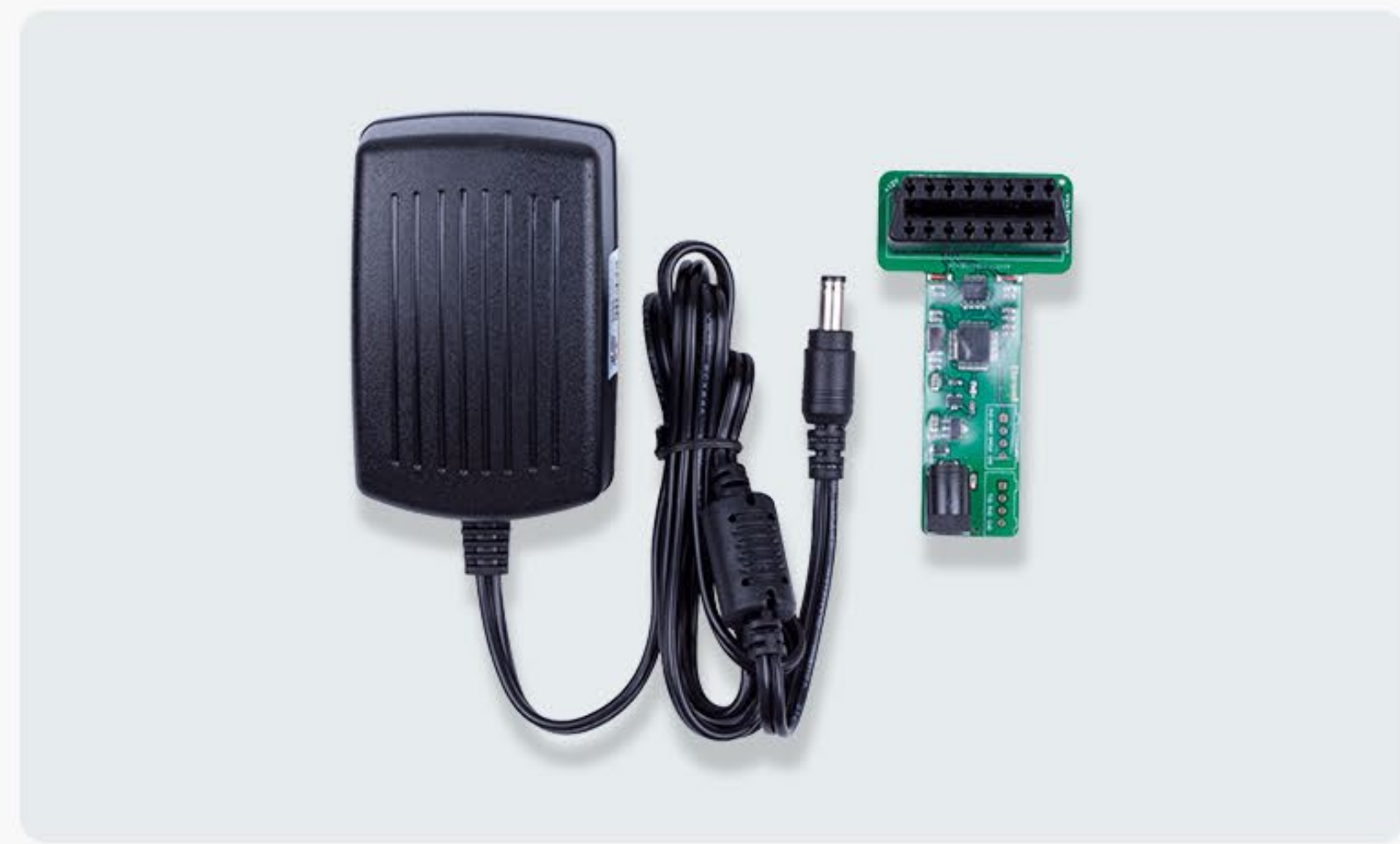
OBD-Simulator OBD Simulator