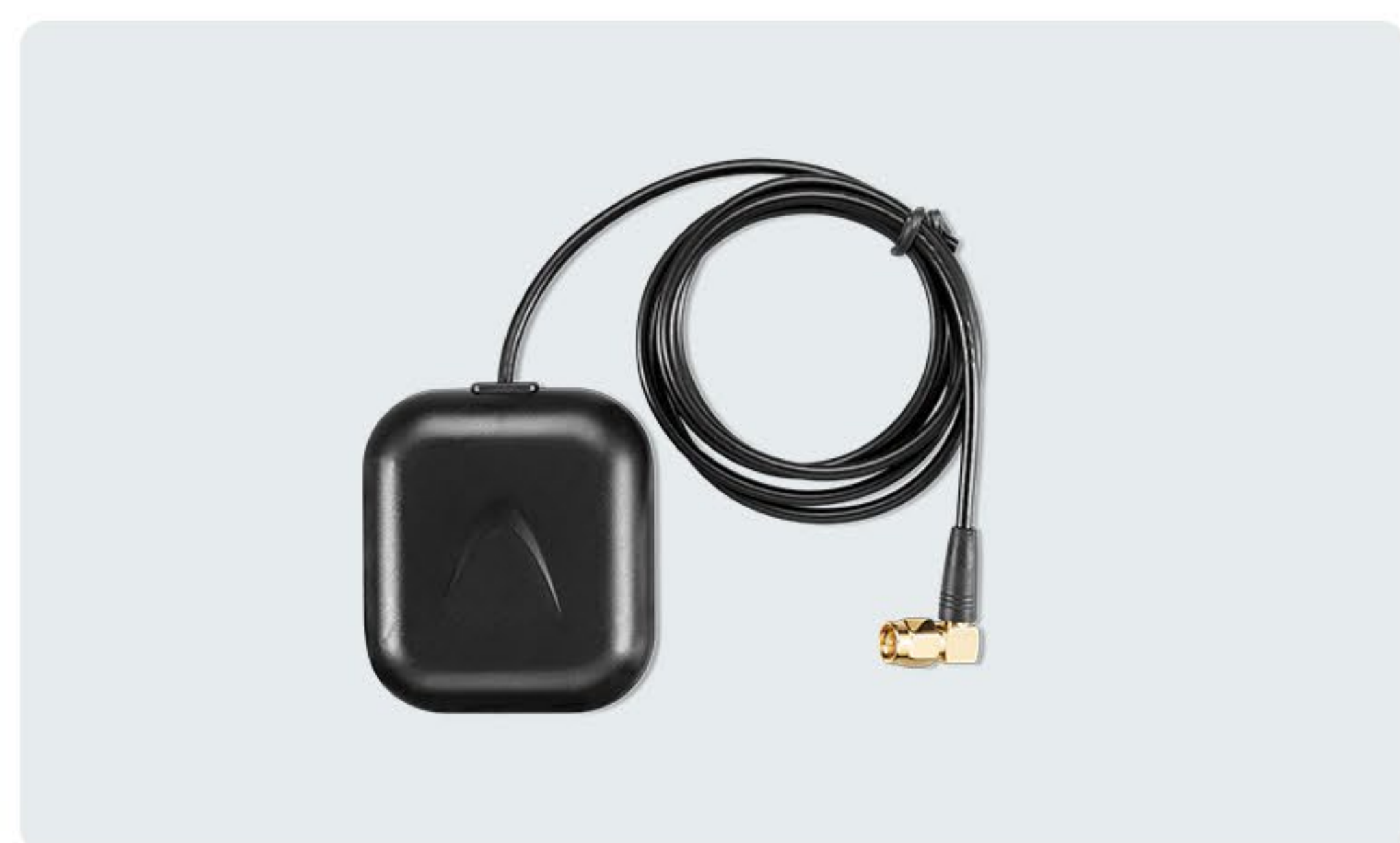
ATN-V600-GPS External GPS antenna