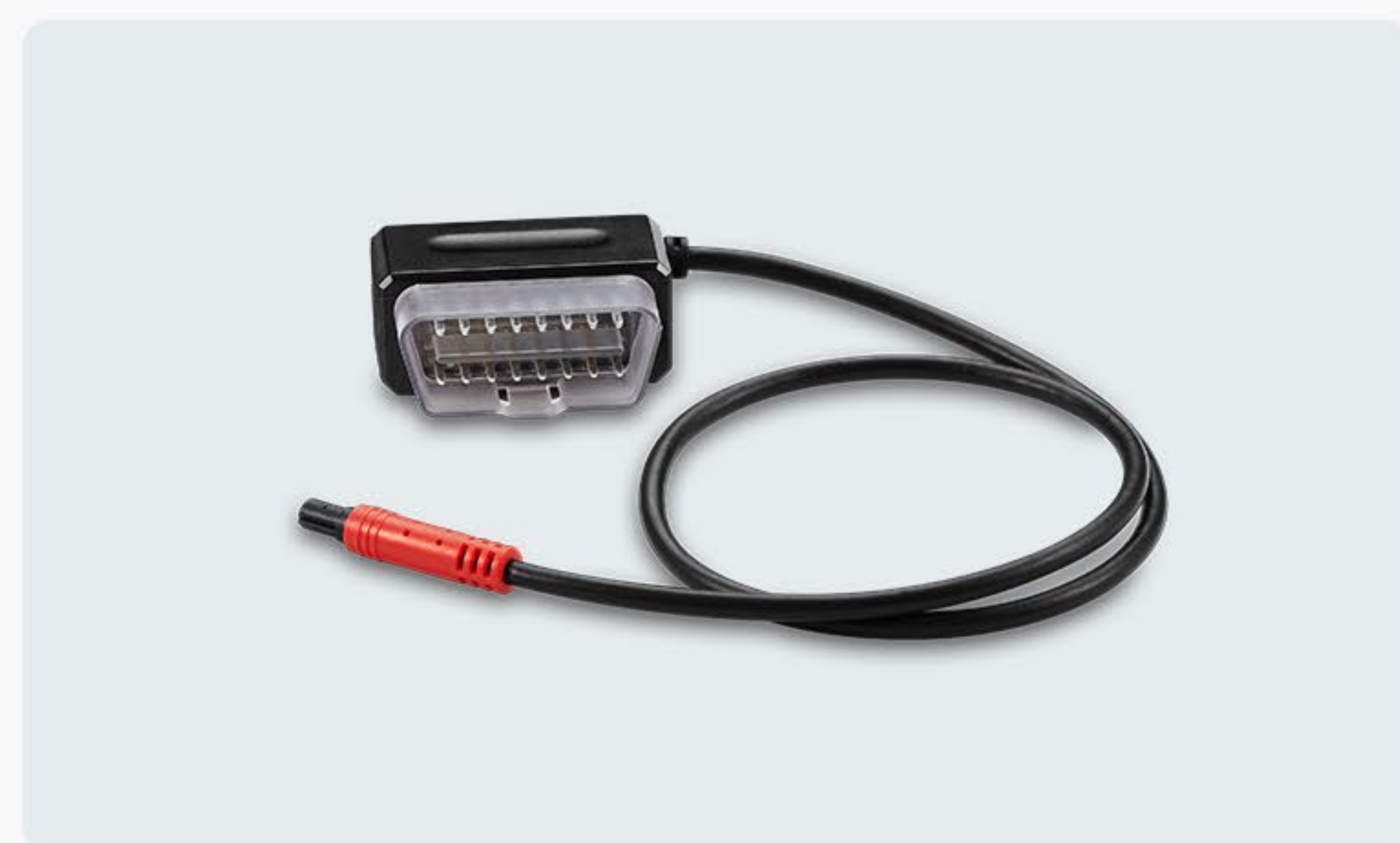
OBD-Connector OBD Connector