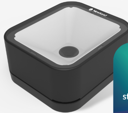
FR27 Urchin stationary scanners