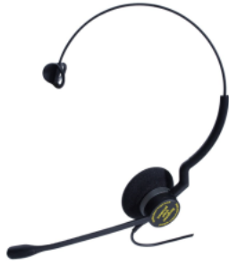
General purpose Headset