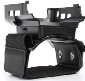
Wearable wrist mount