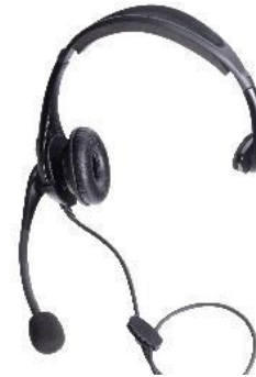
Rugged type Headset