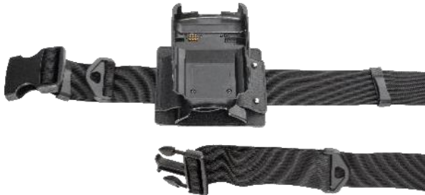
Wearable sled belt