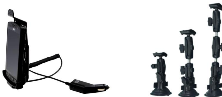
Vehicle Cradle and Cigar Jack (one body)